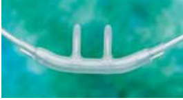
AF-TD18 AFTERMARKET 6' CPAP TUBING GREY