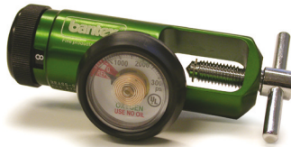
AB-3500M SPINNAKER 0-8 LPM MINI 'E' REGULATOR