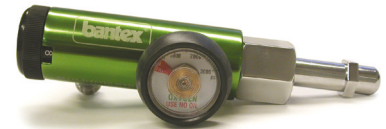
AB-3520 SPINNAKER 0-8 LPM 'H' REGULATOR