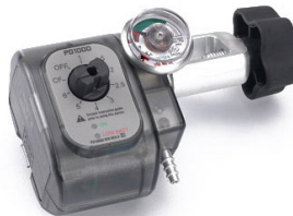
DV-PD1000 DeVILBISS 3 TO 1 CONSERVER