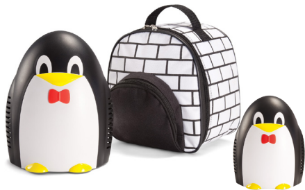
MQ-MQ6002 & MQ-MQ6006 PENGUIN w/ or w/o BAG NEBULIZER w/ DISPOSABLE & REUSABLE NEB CUPS