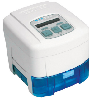
DV-DV53D-HH DeVILBISS INTELLIPAP STANDARD PLUS w/ HEATED HUMIDIFICATION