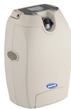
IN-TPO100B INVACARE SOLO PORTABLE CONCENTRATOR