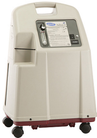
IN-IRC10LX02 INVACARE 10 LITER CONCENTRATOR w/ SENSOR