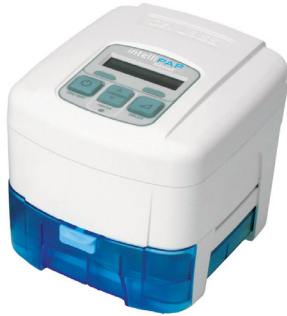
DV-DV51D-HH DeVILBISS INTELLIPAP CPAP w/ HEATED HUMIDIFICATION