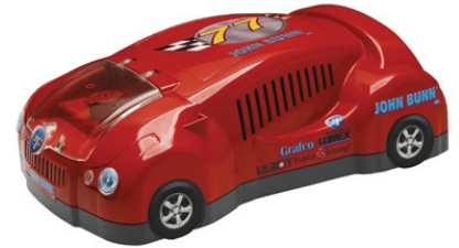
GF-JB0112-067 JOHN BUNN NEB-U-TYKE SPEEDSTER w/ DISPOSABLE NEB CUP