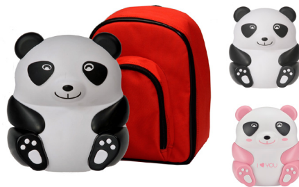
MQ-MQ6003, MQ-MQ6004 & MQ-MQ6005 PANDA w/ or w/o BAG NEBULIZERS w/ DISPOSABLE & REUSABLE NEB CUPS