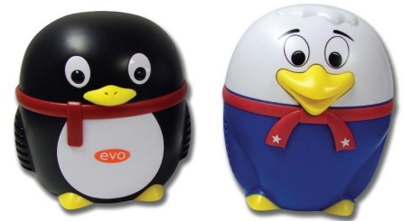
EV-4055 & EV-4056 PENGUIN OR EAGLE NEBULIZERS w/ DISPOSABLE NEB CUP