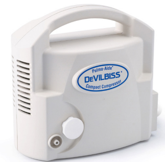
DV-3655D PULMOAID COMPACT COMPRESSOR w/ DISPOSABLE NEB CUP & DVD