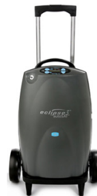
SQ-5900 SEQUAL ECLIPSE 3 PORTABLE CONCENTRATOR