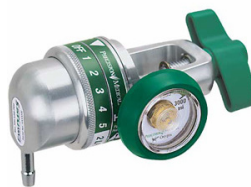
PM-198705 PRECISION MEDICAL EASY PULSE 5 CONSERVER