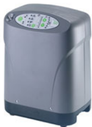
DV-306DS-A DeVILBISS IGO PORTABLE CONCENTRATOR