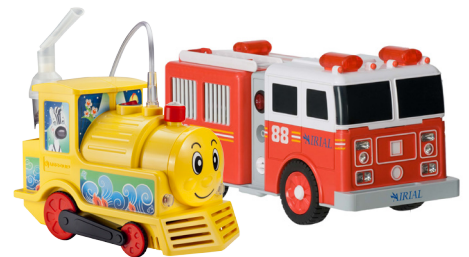
MQ-MQ6008 & MQ-MQ0911 TRAIN OR FIRE TRUCK NEBULIZERS w/ DISPOSABLE NEB CUP