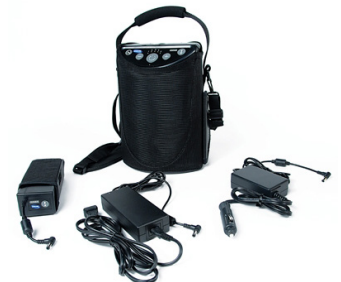
IN-XPO100B INVACARE XPO2 w/ SUPPLEMENTAL BATTERY, AC ADAPTER, DC ADAPTER & ACCESSORY BAG

Lake Court Medical has over 600 oxygen concentrators in stock. That means we have what you need... PLUS if you order by 3pm, we can get it to you next day.