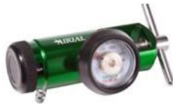
MQ-MQ4200 MEDQUIP 0-8 LPM MINI REGULATOR