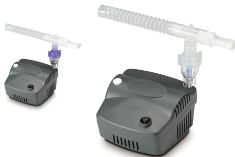
DV-3655LT & DV-3655LTR PULMONEB LT COMPRESSOR w/ DISPOSABLE & REUSABLE NEB CUPS & DVD