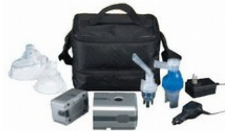
DV-6910P-DR PORTABLE COMPRESSOR NEBULIZER w/ DISPOSABLE & REUSABLE NEB CUPS, BAG, & DVD

Lake Court Medical has over 4,000 adult & pediatric nebulizers in stock. That means we have what you need... PLUS if you order by 3pm, we can get it to you next day.