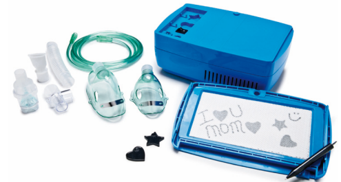
GF-JB0112-067 JOHN BUNN NEB-A-DOODLE w/ DISPOSABLE NEB CUP