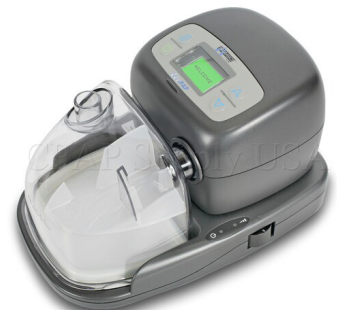
PMI-7500 PROBASICS CPAP CORE BUNDLE w/ HEATED HUMIDIFIER, 6' TUBING & CARRY BAG

Lake Court Medical has over 250 CPAP devices in stock. That means we have what you need... PLUS if you order by 3pm, we can get it to you next day.