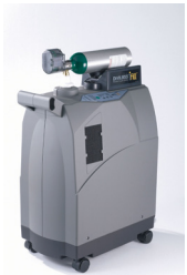
DV-535D DeVILBISS iFILL PERSONAL OXYGEN STATION