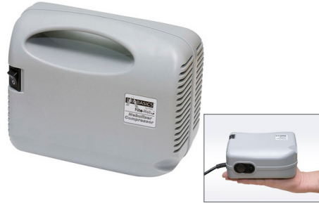
PMI-8005LP & PMI-8005LP PERM DRIVE PACIFICA NEBULIZER w/ DISPOSABLE & REUSABLE NEB CUPS