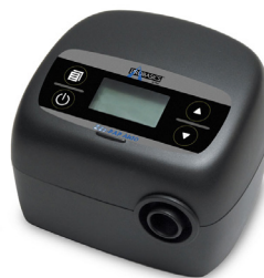
PMI-7541 PROBASICS AUTO ADJUST ZZZ PAP CPAP MACHINE