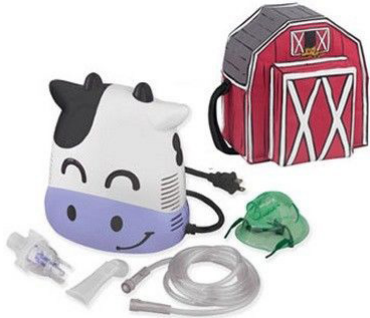
DM-40-269-000 MARGO MOO COMPRESSOR NEBULIZER KIT w/ DISPOSABLE NEB CUP