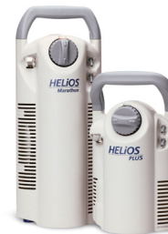
HEL-H850 PORTABLE LIQUID OXYGEN