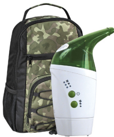
DM-4-365-000 GREEN NEBPAK ULTRASONIC NEBULIZERS w/ DISPOSABLE & REUSABLE NEB CUPS