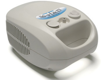
GF-JB0112-061 NEB-U-LITE EV NEBULIZER w/ DISPOSABLE NEB CUP