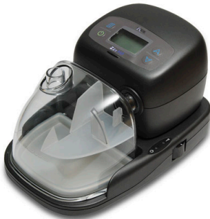
PMI-7540 PROBASICS ZZZ-PAP AUTO CPAP WITH HEATER