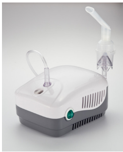
MQ-MQ5600 & MQ-MQ5700 MEDNEB COMPRESSOR w/ DISPOSABLE & REUSABLE NEB CUPS