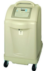
SQ-9620 SEQUAL INTEGRA E-Z 10 LPM CONCENTRATOR