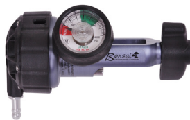
DR-OM-810 BONSAI PNEUMATIC OXYGEN CONSERVER