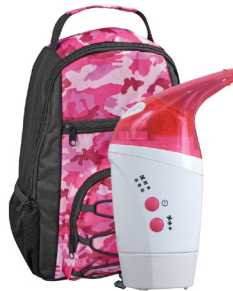
DM-40-366-000 PINK NEBPAK ULTRASONIC NEBULIZERS w/ DISPOSABLE & REUSABLE NEB CUPS