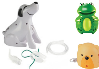
ROS-NEB-DOG, ROS-FROG-NEB, & ROS-NEB-BEAR DOG, FROG, OR BEAR NEBULIZERS w/ DISPOSABLE NEB CUP