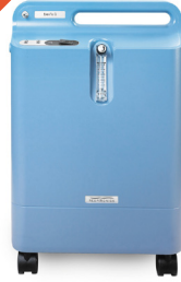
RE-1020001 EVERFLO OXYGEN CONCENTRATOR