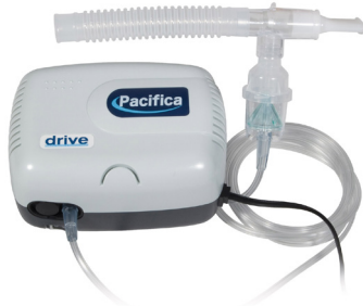
DR-18070 & DR-18071 DRIVE PACIFICA NEBULIZER w/ DISPOSABLE NEB CUP