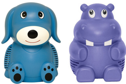
PMI-8011 & PMI-8012 DOG OR HIPPO NEBULIZERS w/ DISPOSABLE NEB CUP