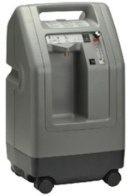
DV-525DS DeVILBISS 5 LITER CONCENTRATOR w/ OSD