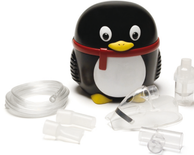
GF-JB0112-062 JOHN BUNN NEB-U-TYKE PENGUIN w/ DISPOSABLE NEB CUP