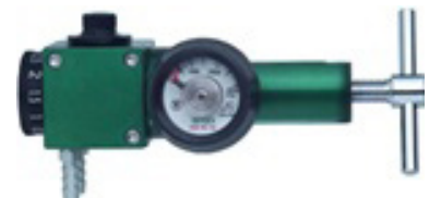
IO-2LC DUAL LUMEN CONSERVER

Lake Court Medical has over 1,400 regulators & conservers in stock. That means we have what you need... PLUS if you order by 3pm, we can get it to you next day.