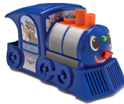
GF-JB0112-164 JOHN BUNN NEB-U-TYKE TRAIN w/ DISPOSABLE NEB CUP