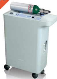
RE-1074932 ULTRAFILL HOME OXYGEN SYSTEM