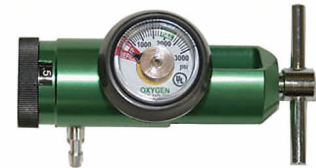
PMI-OC3 PMI 'H' REGULATOR 0-15 LPM