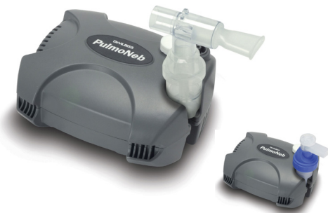
DV-3655DX & DV-3655TX PULMONEB COMPACT COMPRESSOR w/ DISPOSABLE & REUSABLE NEB CUPS & DVD