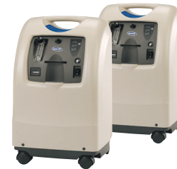
IN-IRC5PO2 IN-IRC5PO2V IN-IRC5PO2W INVACARE PERFECTO 5 LITER CONCENTRATOR w/ SENSOR