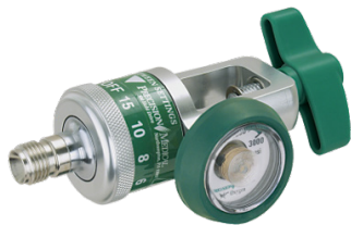
ZPM-168708D PRECISION MEDICAL 0-8 LPM "E" TANK REGULATOR