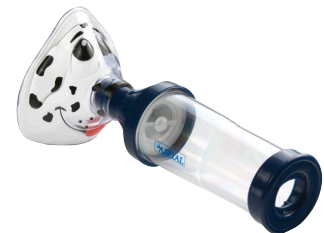
MQ-MQ8100 ARIAL CHAMBER FOR METERDOSE INHALERS

Lake Court Medical has over 4,000 adult & pediatric nebulizers in stock. That means we have what you need... PLUS if you order by 3pm, we can get it to you next day.