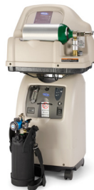
IN-IOH200PC INVACARE HOMEFILL PACKAGE