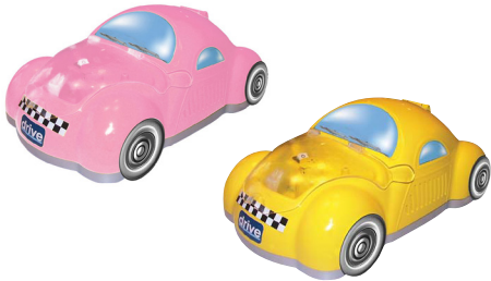
DR-18040-P & DR-18040-Y DRIVE CHECKER CAB NEBULIZER (PINK OR YELLOW)