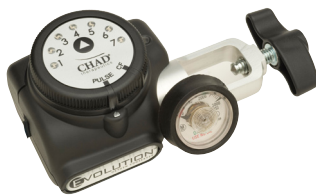
DR-OM-900 EVOLUTION ELECTRONIC OXYGEN CONSERVER