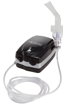
MQ-MQ5501 VOYAGER PORTABLE NEBULIZER w/ DISPOSABLE & REUSABLE NEB CUPS