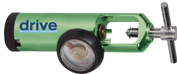
DR-18300G DRIVE 0-3 LPM "E" PEDIATRIC REGULATOR