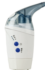
DM-40-370-000 BLUE NEBPAK ULTRASONIC NEBULIZERS w/ DISPOSABLE & REUSABLE NEB CUPS

Lake Court Medical has over 4,000 adult & pediatric nebulizers in stock. That means we have what you need... PLUS if you order by 3pm, we can get it to you next day.