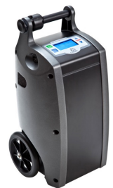
O2-800-0001-2 OXLIFE PORTABLE CONCENTRATOR