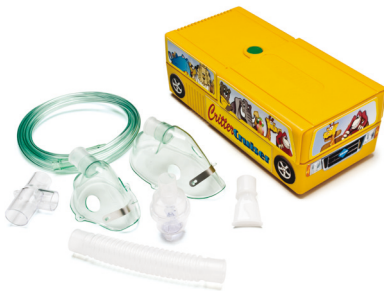
GF-JB0112-063 JOHN BUNN NEB-U-TYKE BUS w/ DISPOSABLE NEB CUP