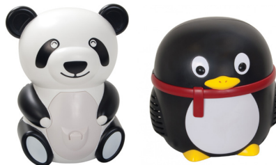
DR-18090-PB & DR-18090-PG PANDA OR PENGUIN NEBULIZERS w/ DISPOSABLE NEB CUP